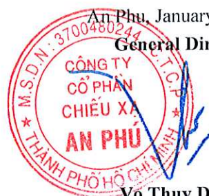
Võ Thụy Dương